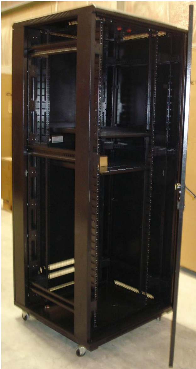
Cabinet with 2 shelves