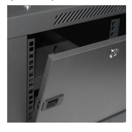
Removable Side Panels with optional side panel lock