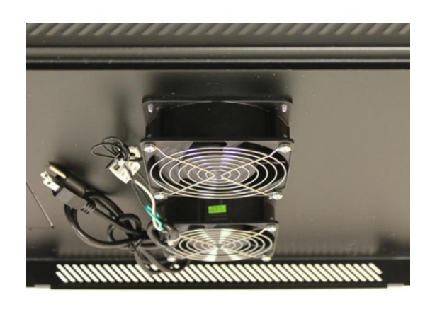
Cabinets Fans for Ventilation